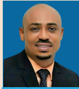
RT. HON. INIOBONG ROBSON ESIT EKET LGA