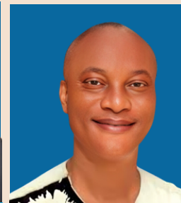
RT. HON. NSIKAK EKONG IKOT EKPENE LGA