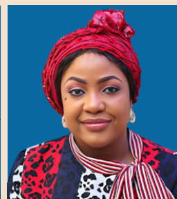
PRINCESS EMEM IBANGA NSIT ATAI LGA