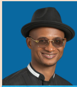
DR. JOHN EKEM ORUK-ANAM LGA