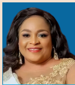
RT. HON. ALICE EKPENYONG MBO LGA