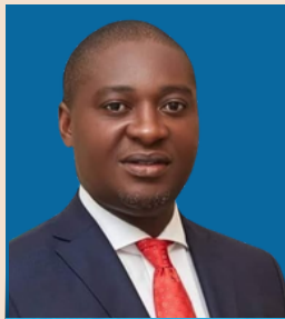
HON. FRANK ARCHIBONG EKET LGA